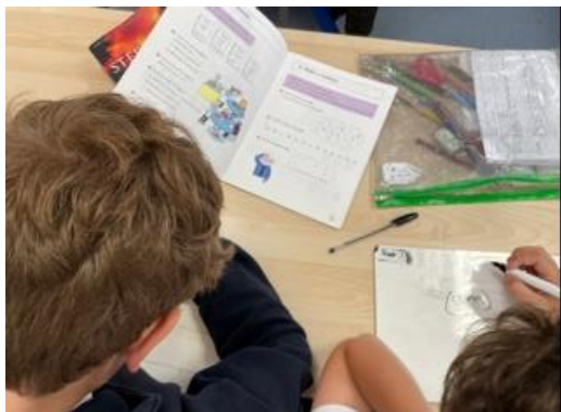
Apex problem solving- working with a partner.