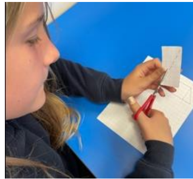
Finding area of triangle and parallelogram based on knowledge of area of a rectangle.