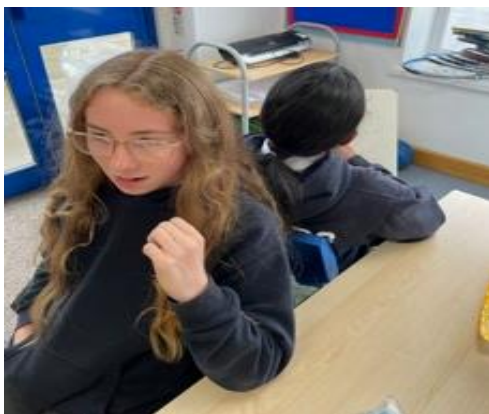
Back to back describing shapes using key vocabulary from the board.