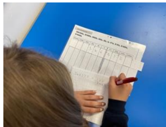
Using a sliding scale to work out \times and \div by 10, 100 and 1000.