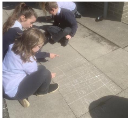
Drawing place value grids and using them to multiply and divide by 10, 100 and 1000.