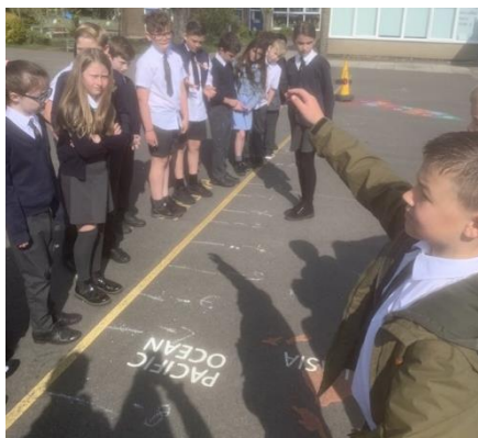
Comparing and finding the difference between negative numbers.