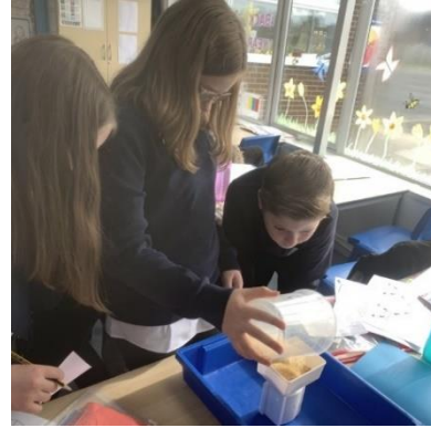
Weighing amounts using varying scales accurately.