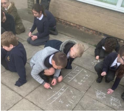
Short multiplication practise using chalks outside.

At Nunthorpe Primary we have a fun, practical and real-life approach to Mathematics that promotes an enthusiasm for learning and a resilience to challenge. The children tackle new concepts through practical activity, exploration and discussion.