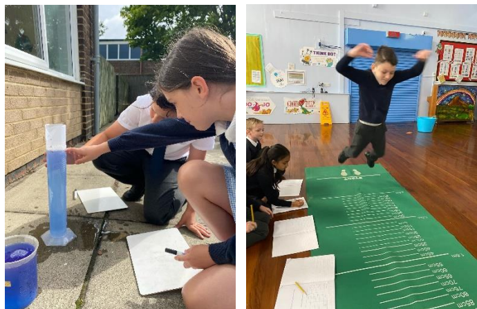
Developing our understanding of units of measure and making connections between measure and number.