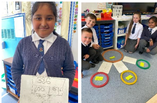
Using bar models and part-whole models to represent 3-digit numbers.

At Nunthorpe Primary we have a fun, practical and real-life approach to Mathematics that promotes an enthusiasm for learning and a resilience to challenge. The children tackle new concepts through practical activity, exploration and discussion.