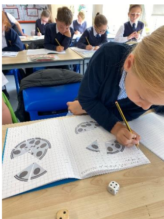
Using pictorial methods to add fractions with the same denominator.