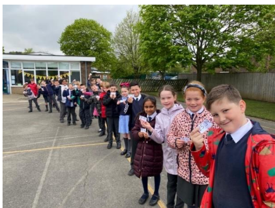
Creating a human number line to support place value, including whole numbers, fractions and decimals.