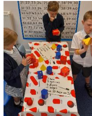
Recognising 3D shapes and their properties. Solving shape problems.