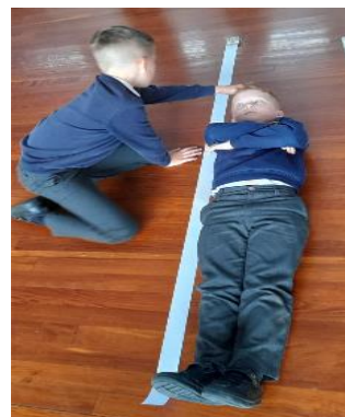
Statistics and data. Estimate and measure. Compare and draw graphs. Interpret data.