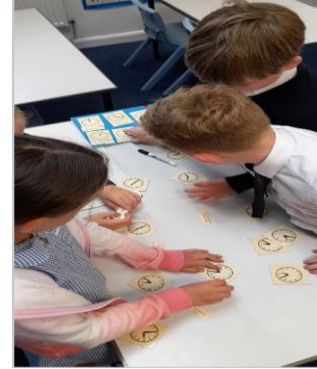
Telling the time to the nearest minute and finding time intervals