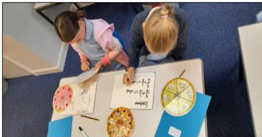
Learning about fractions, equivalent fractions, finding fractions of amounts and adding fractions together.