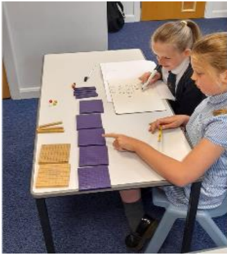
Adding two 3-digit numbers together using column additions

At Nunthorpe Primary we have a fun, practical and real-life approach to Mathematics that promotes an enthusiasm for learning and a resilience to challenge. The children tackle new concepts through practical activity, exploration and discussion.