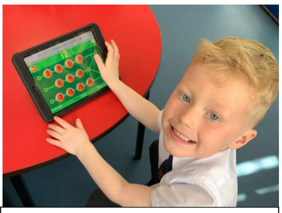
Year 1 learning their times tables using the iPads.