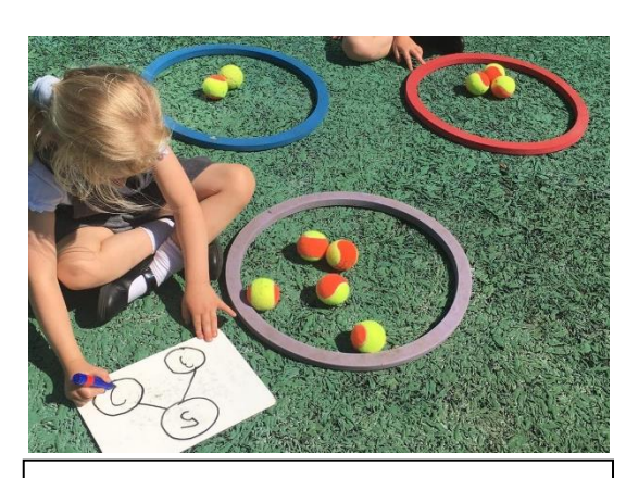
Creating a part whole model for number bonds.