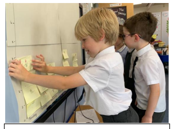
The children data collecting and creating a class bar chart.

At Nunthorpe Primary we have a fun, practical and real-life approach to Mathematics that promotes an enthusiasm for learning and a resilience to challenge. The children tackle new concepts through practical activity, exploration and discussion.