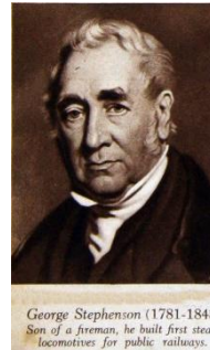
George Stephenson (1781-1848) Son of a fireman, he built first steam locomotives for public railways.